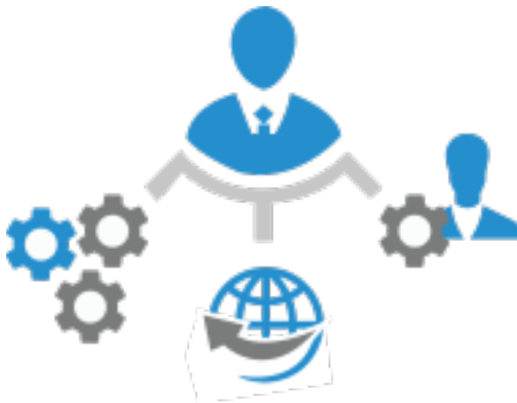
Operations Manager Employed 雇用经理人管理