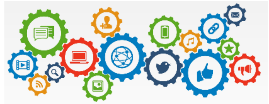
Marketing Executive Employed 雇用市场营销主管