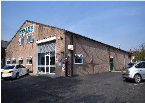
Purchase of new premises 购买了新的工厂