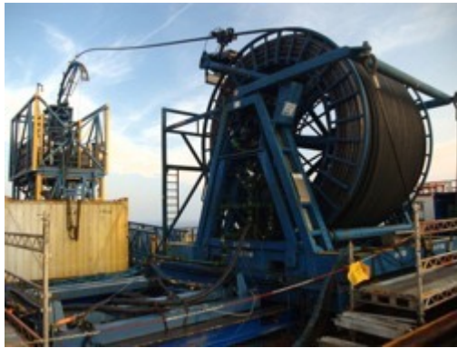
Coil Tubing 卷筒