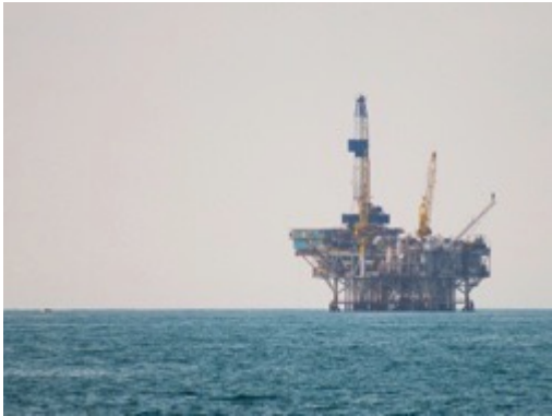
Marine - Offshore 海运业 - 钻井平台