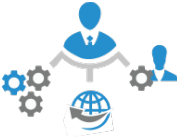
Operations Manager Employed 雇用经理人管理