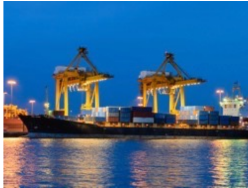
Marine - Dockside 海运业 - 码头设备