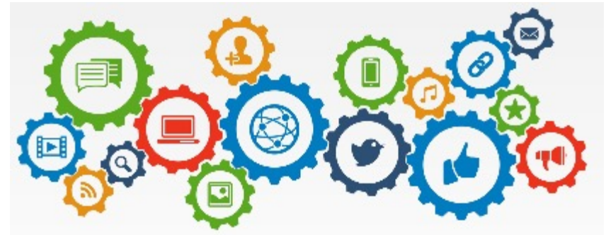
Marketing Executive Employed 雇用市场营销主管