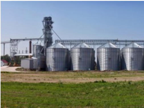
Food & Pharmaceutical 食品和制药工业