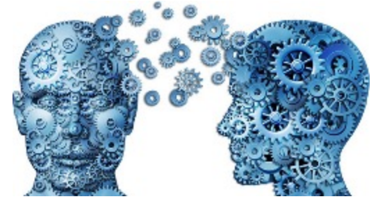
Introduction of Knowledge-Share Scheme 引进了知识共享计划