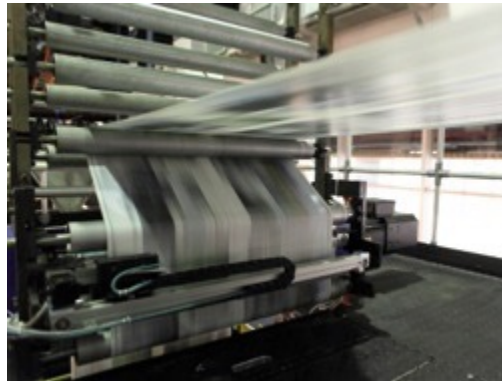
General Industry 常规工业