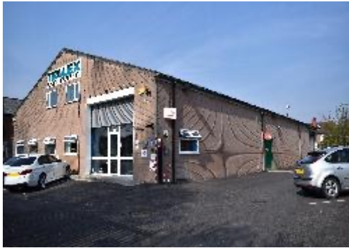
Purchase of new premises 购买了新的工厂